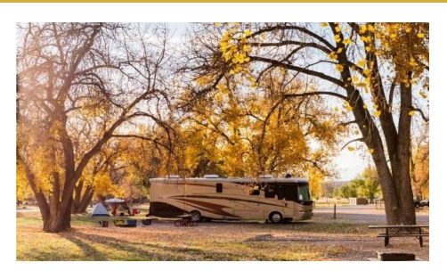
RV/Travel Trailer Loan

Up to $ for 12 months with a Credit Score of > 625